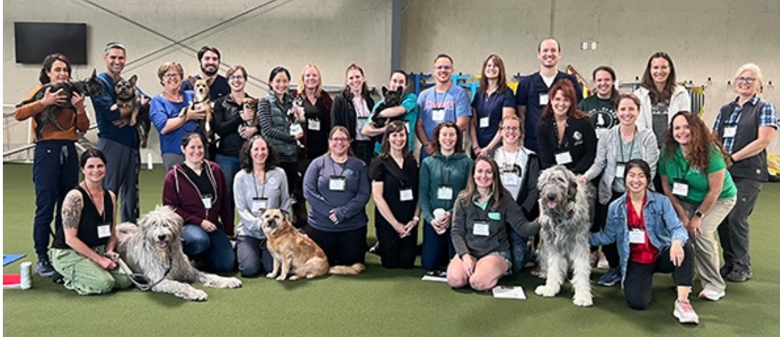
Students, faculty and dog professors paused for a class photo during Veterinary Medical Acupuncture for Sports Medicine/Rehabilitation Patients (Module 2) , held September 22-24 in Littleton, Colorado.