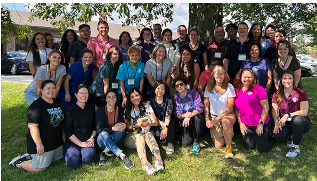
Students, faculty, and a dog professor gathered for a class photo during Clinical Skills , held September 29-October 1 in Springfield, Missouri.